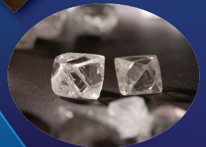
Photographs of diamonds courtesy of Petra Diamonds